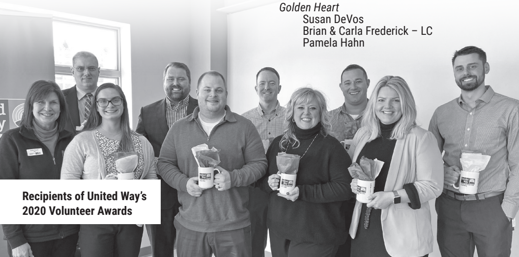
Recipients of United Way's 2020 Volunteer Awards