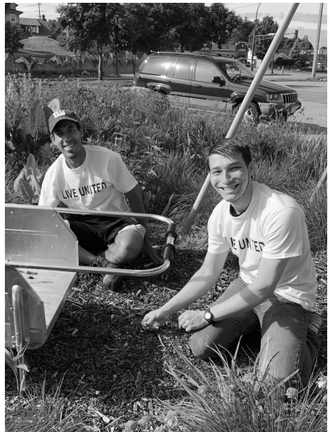
Last year volunteers gave more than 9,000 hours of service.