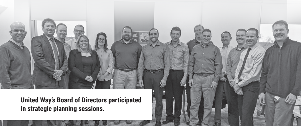
United Way's Board of Directors participated in strategic planning sessions.