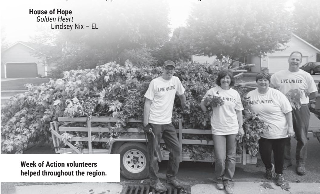
Week of Action volunteers helped throughout the region.