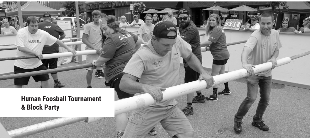
Human Foosball Tournament & Block Party