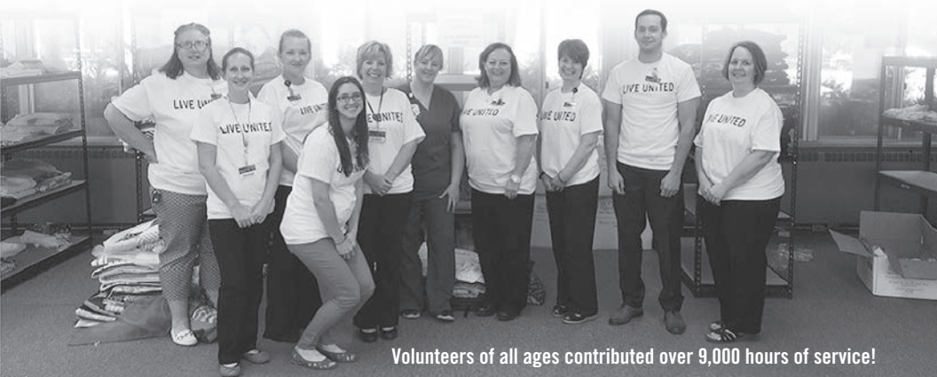
Volunteers of all ages contributed over 9,000 hours of service!