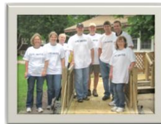
Making a volunteer connection