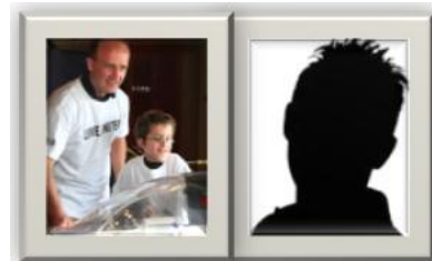
2012 Mentor Initiative