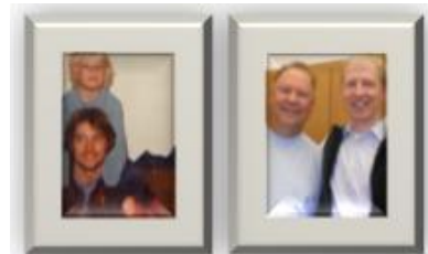
Mentor match then & now