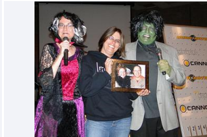
Johnson Outdoors' creepy game show hosts with Plinko mystery prize winner!